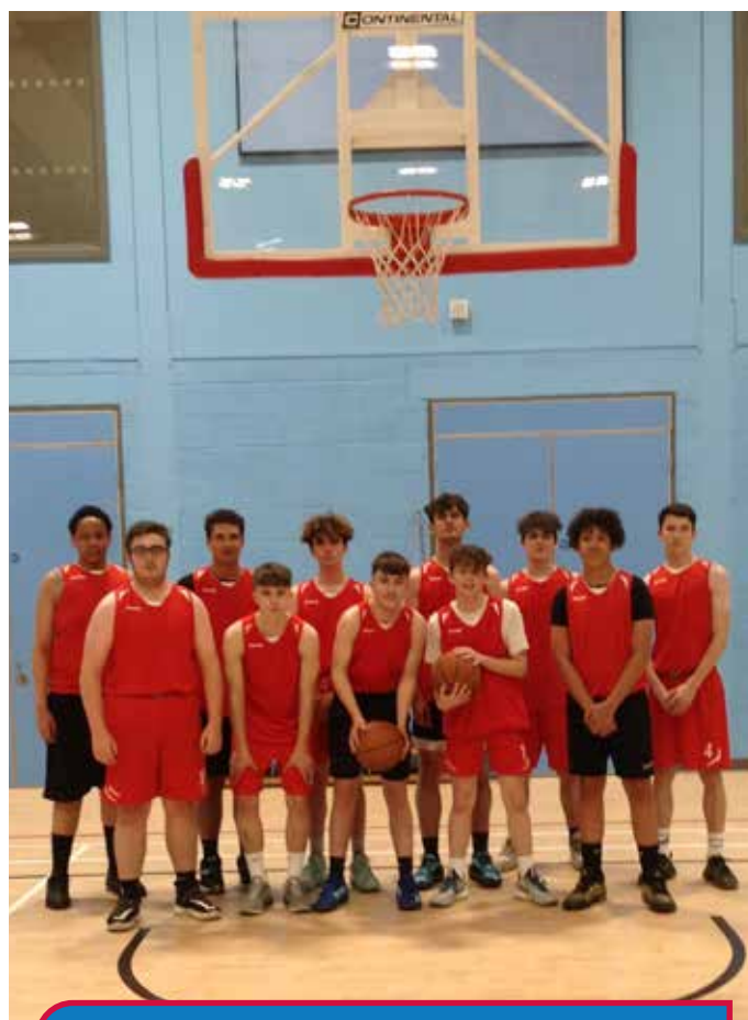
U16 Boys Basketball Team